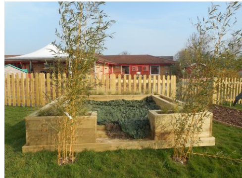
Foundation Stage outdoor area