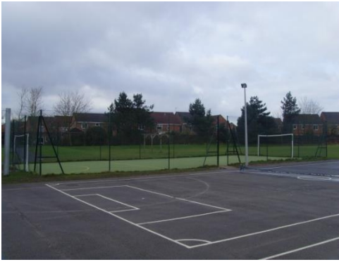
Astro-turf football pitch