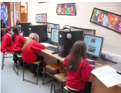
Learning Resource Room