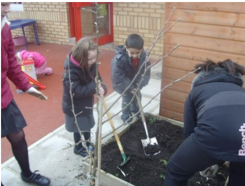
Community Room Veg Plots