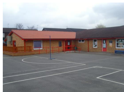
Key Stage 2 playground