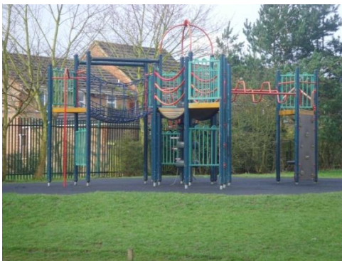
Key Stage 2 climbing frame