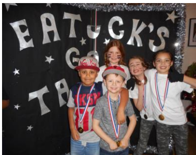
PTFA Talent Show

We welcome all new parents/carers to come and join the school's PFTA. The Friends of Eatock are an informal group of parents and carers who are focussed raising funds for the children.