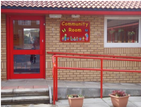
The Community Room classroom

We are proud of our school building and grounds which we all work very hard to maintain, to provide a safe and stimulating environment within which the children can grow and learn.