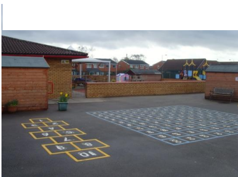
Key Stage 1 playground