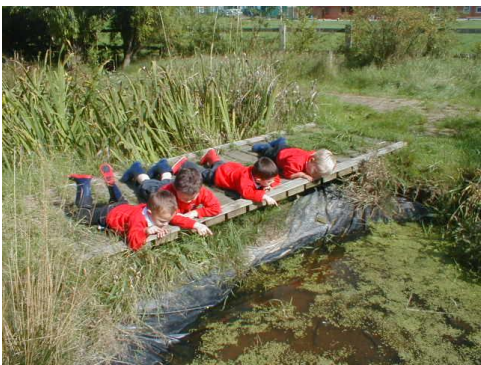
The Wild Life Area